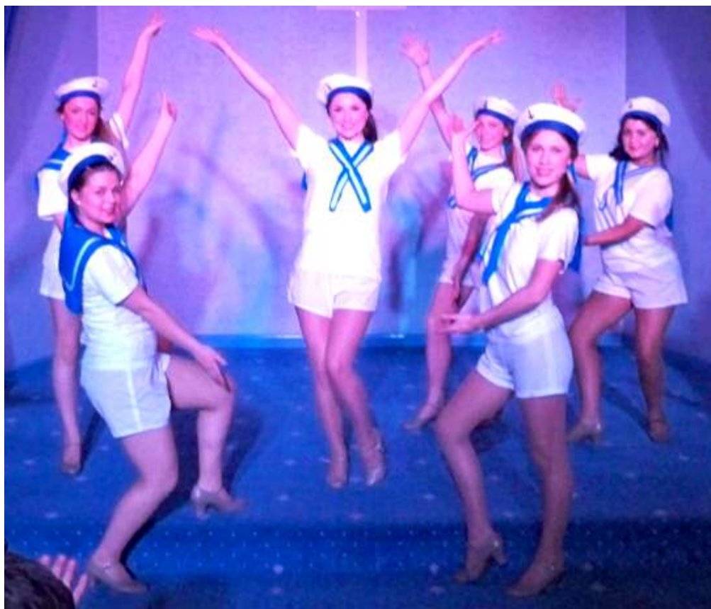
Some of the Pantomime Senior Dancers at the end of their routine at the hugely successful Mission Possible Cabaret & Mini-Meal .