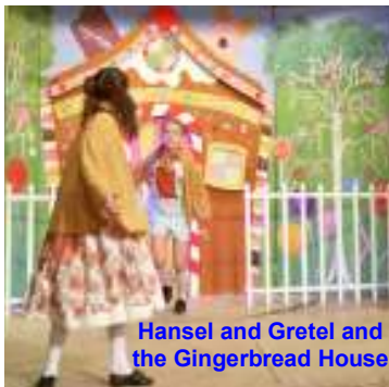
Hansel and Gretel and the Gingerbread House

Look out for details of the next Family Film Evening on 15th July