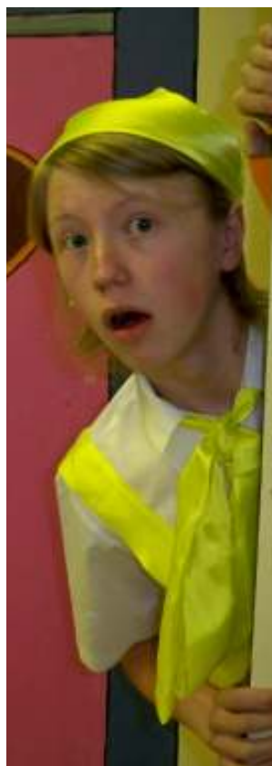
Old King Cole and the Queen of Hearts pose outside the Royal Bakery as Humpty peers in. More pictures inside from another wonderful pantomime.