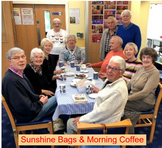
Sunshine Bags & Morning Coffee