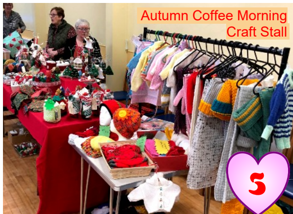
Autumn Coffee Morning Craft Stall