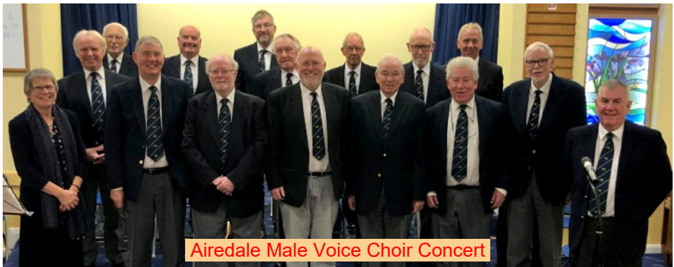
Airedale Male Voice Choir Concert

Social/Fundraising events have been many and varied!