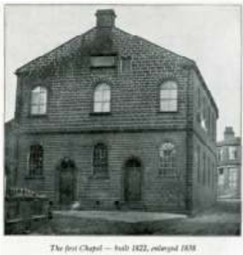
The first Chapel — built 1822, enlarged 1858

We join in the Queen's Platinum Jubilee Celebrations with a special Morning Service followed by a Bring and Share Lunch - hopefully outside the Church if the weather is kind.