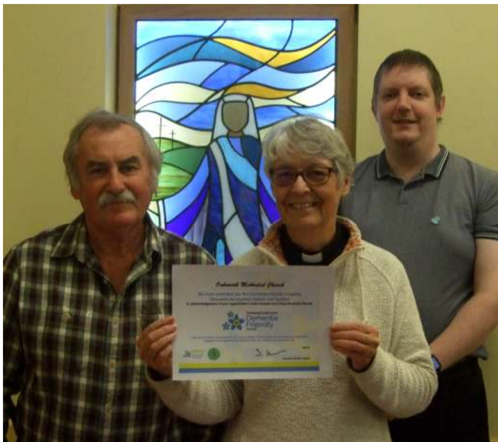
The Church receives Dementia Friendly Keighley's Recognition Award