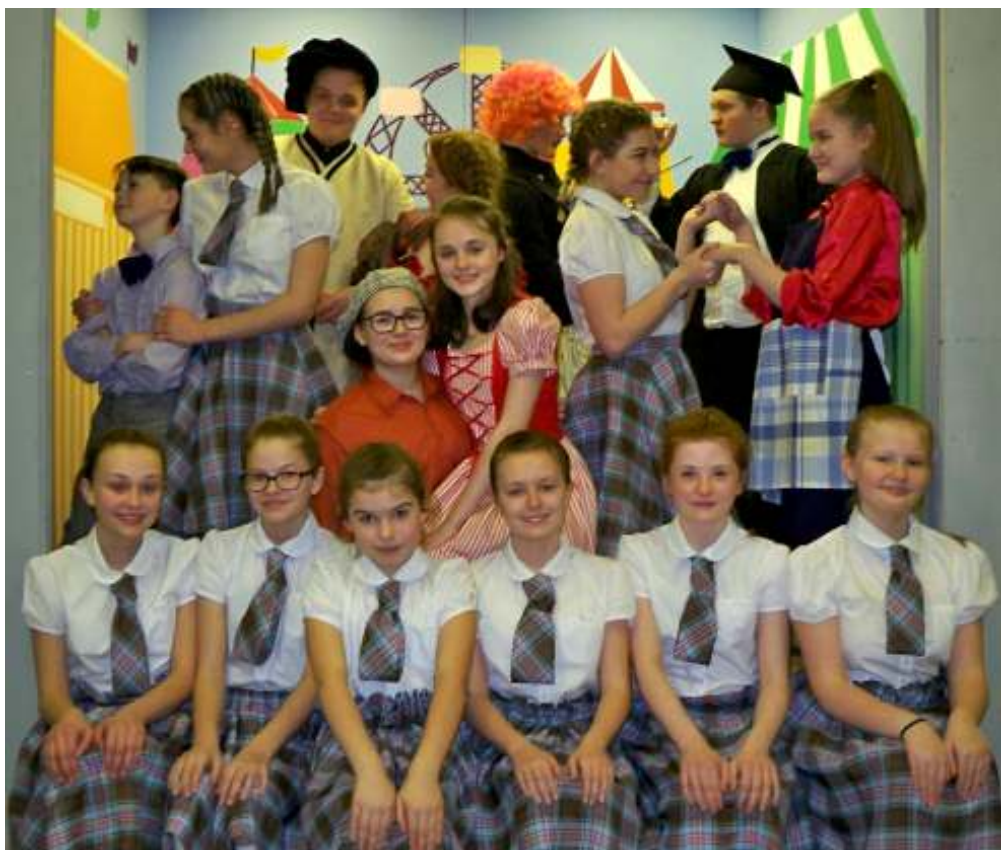
Principal members of the cast of Little Tommy Tucker - our latest successful pantomime adventure. More photos inside.